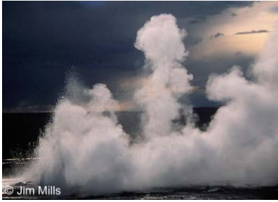
POWER - "Steam Power" by Jim Mills