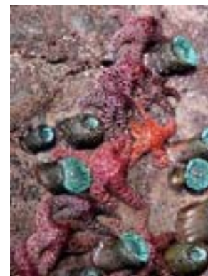
"WHEN THE TIDE GOES OUT"