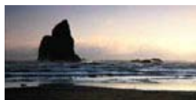
"CANNON BEACH AT DUSK"