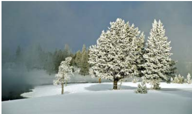
"Flocked Trees in Mist 2"